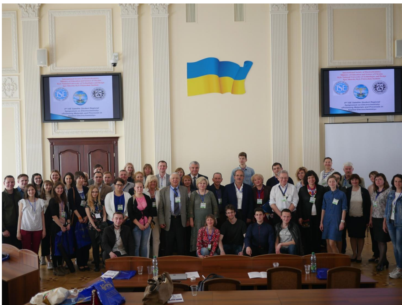
Joint photo of Symposium-2019 attendees

The best poster presentations of young scientists were awarded by the special Diplomas of Symposium Organizing Committee.