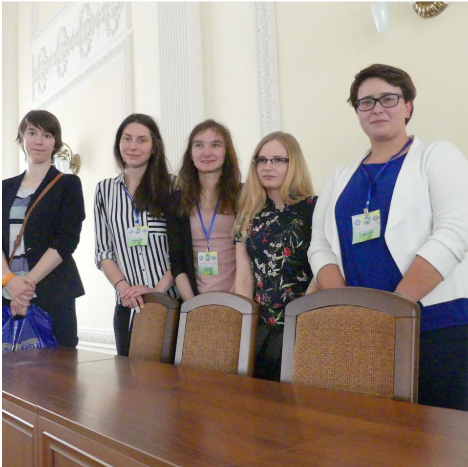
Polish student team from the Jagellonian University, Cracow