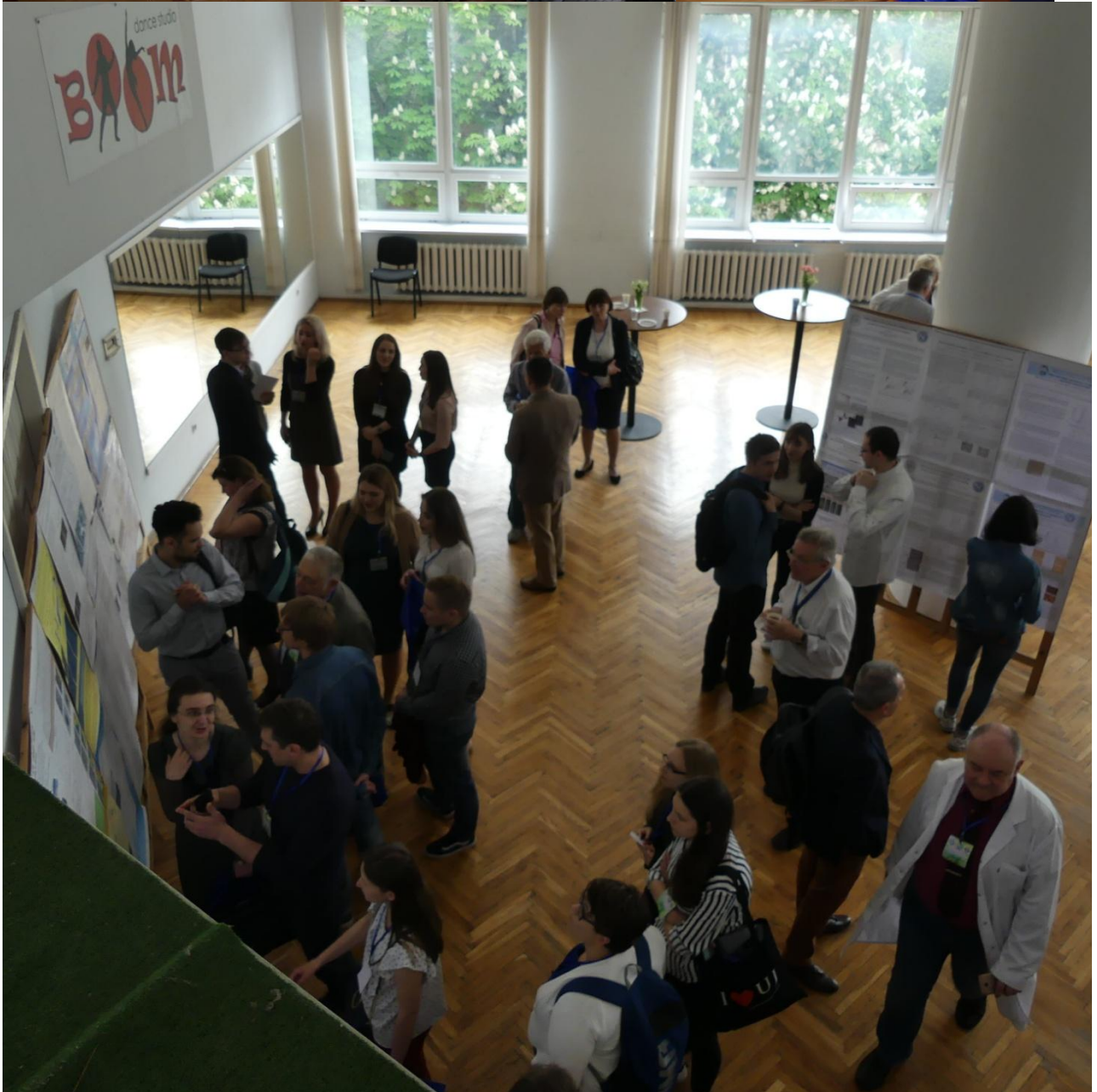
During the poster sessions students and young participants presented their findings and had